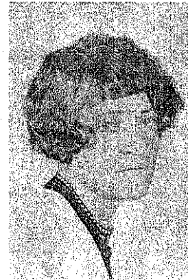
Ruth Suckow in 1928

the town could do basic maintenance and the association could insure that everything is kept in good order.